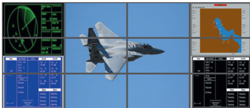
Original source aspect ratios not maintained – results in image distortion