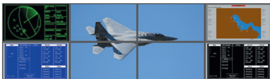
Original source aspect ratios maintained